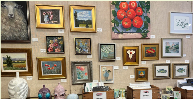
The Harrison Brothers Gallery features 2- and 3-dimensional artwork by local artists. Enhancements to the Gallery will be made after the holidays.

More than 150 guests attended a festive "meet the artists" reception at the new Harrison Brothers Gallery in October. The event featured 11 visual artists whose works are now on exhibit and available for sale. And what a sale it was, with 38 paintings sold during the two-hour reception! Future quarterly events are planned and will celebrate the arts and the Gallery's talented local artists.