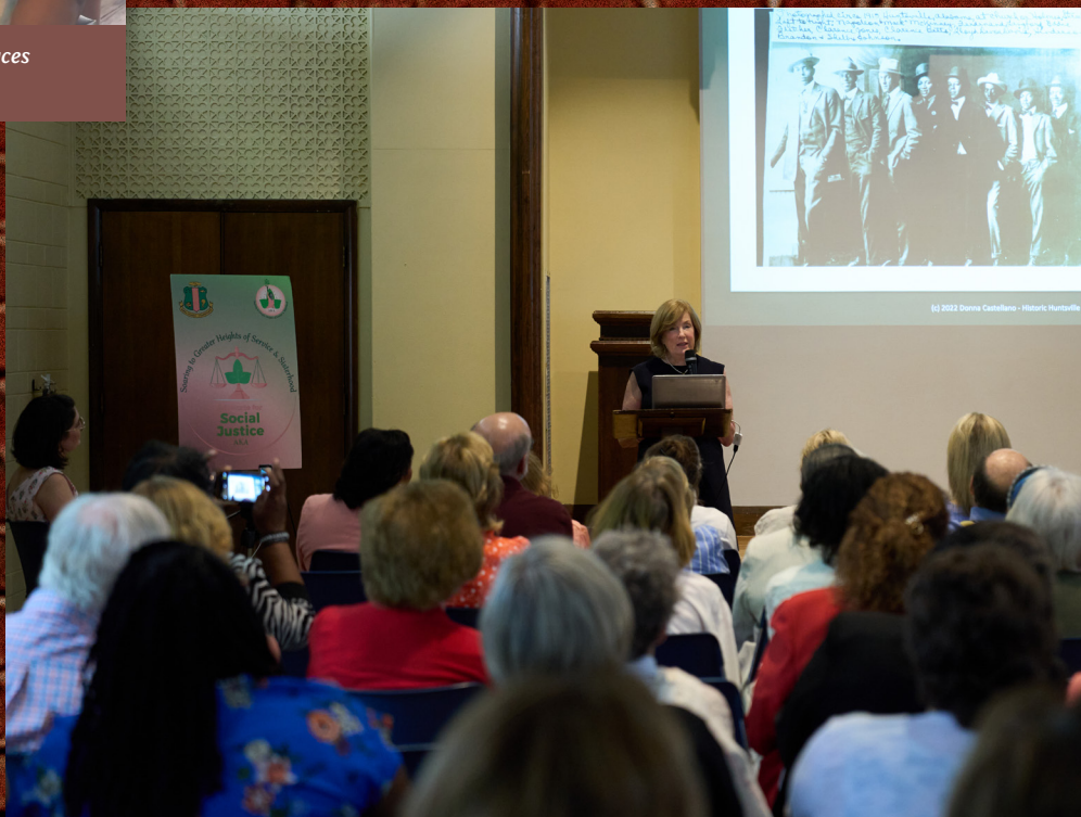
This public presentation focused on the activism of Huntsville’s Black suffrage and civil rights leaders