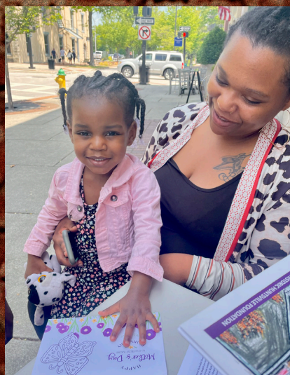
Our “Best Moms in History” Mother’s Day card art project recognize Huntsville women of history