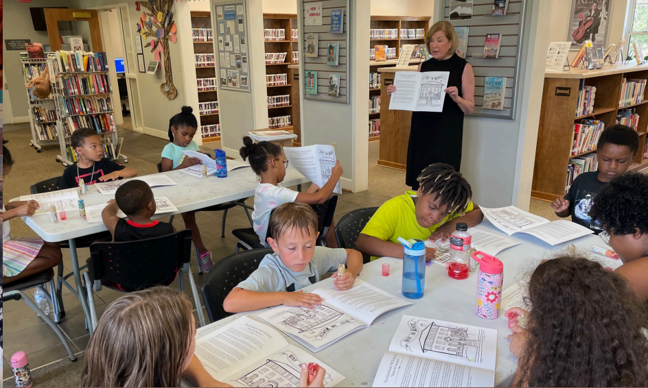
There were smiles all around at our “Huntsville Women Who Made History” program at the Triana branch of the Huntsville-Madison County Public Library