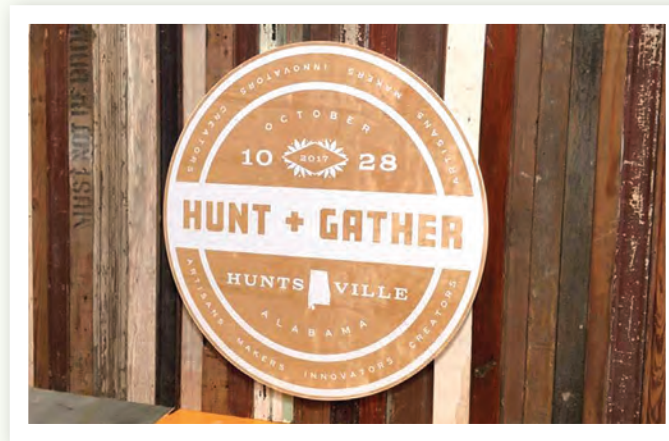
HHF is proud of our partnership with Hunt+Gather, an innovative marketplace that celebrates artists, artisans, and other makers.

sponsor of the event and in turn HHF would have a new audience and venue to display and sell these wonderful pieces of history. She also wanted items from the basement to feature heavily in her design of the space. The space, an out-of-use Regions Bank drive thru, would soon be transformed in a way that only someone with true design gifts could.